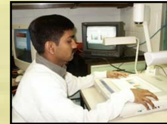
Fig 4. Computer Image Analysis System in use