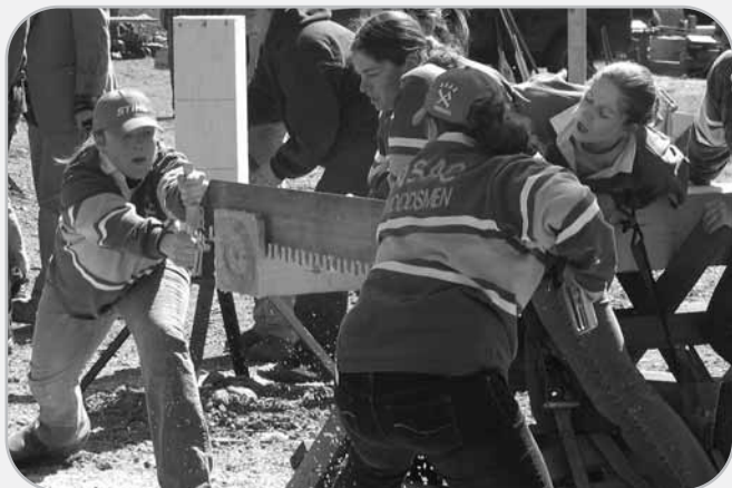
The NSAC Woodsman team are now better equipped because of financial support from the Rick Russell Memorial Woodsman fund.