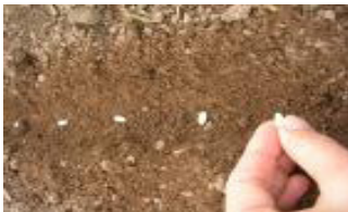
Bean seed is large, making it easy to handle for even spacing in the furrow.